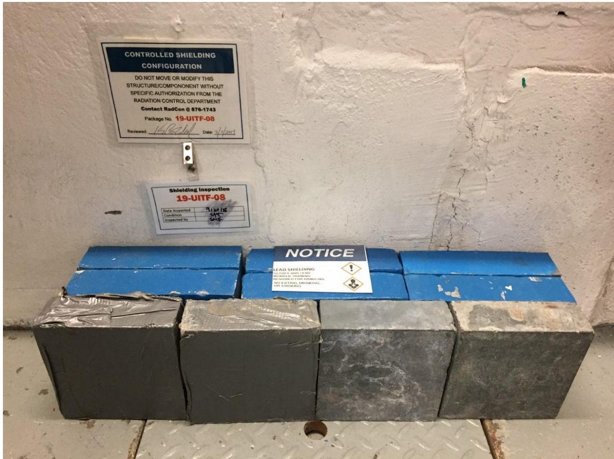
Figure 4 Trench 4 (near insertable Faraday Cup IFYM401, adjacent to Control Room, Cave1)