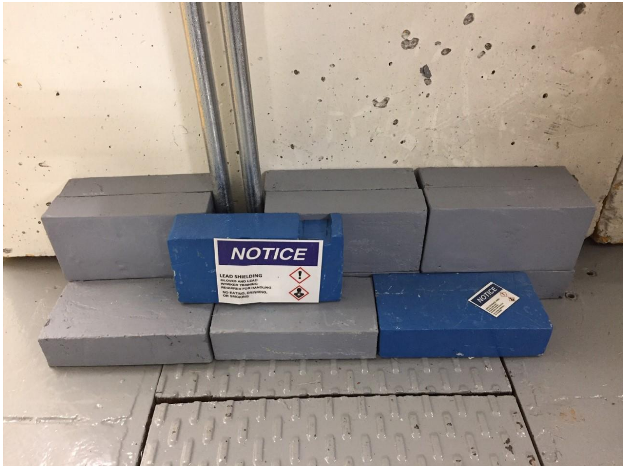
Figure 5 Trench 5 (near the labyrinth exit/entrance, Cave2)