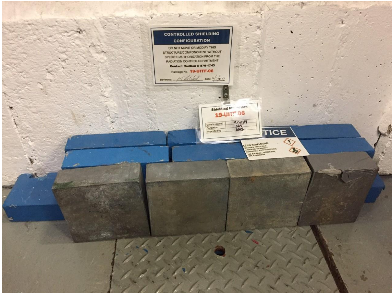
Figure 3 Trench 3 (near the QCM, Cave 1)