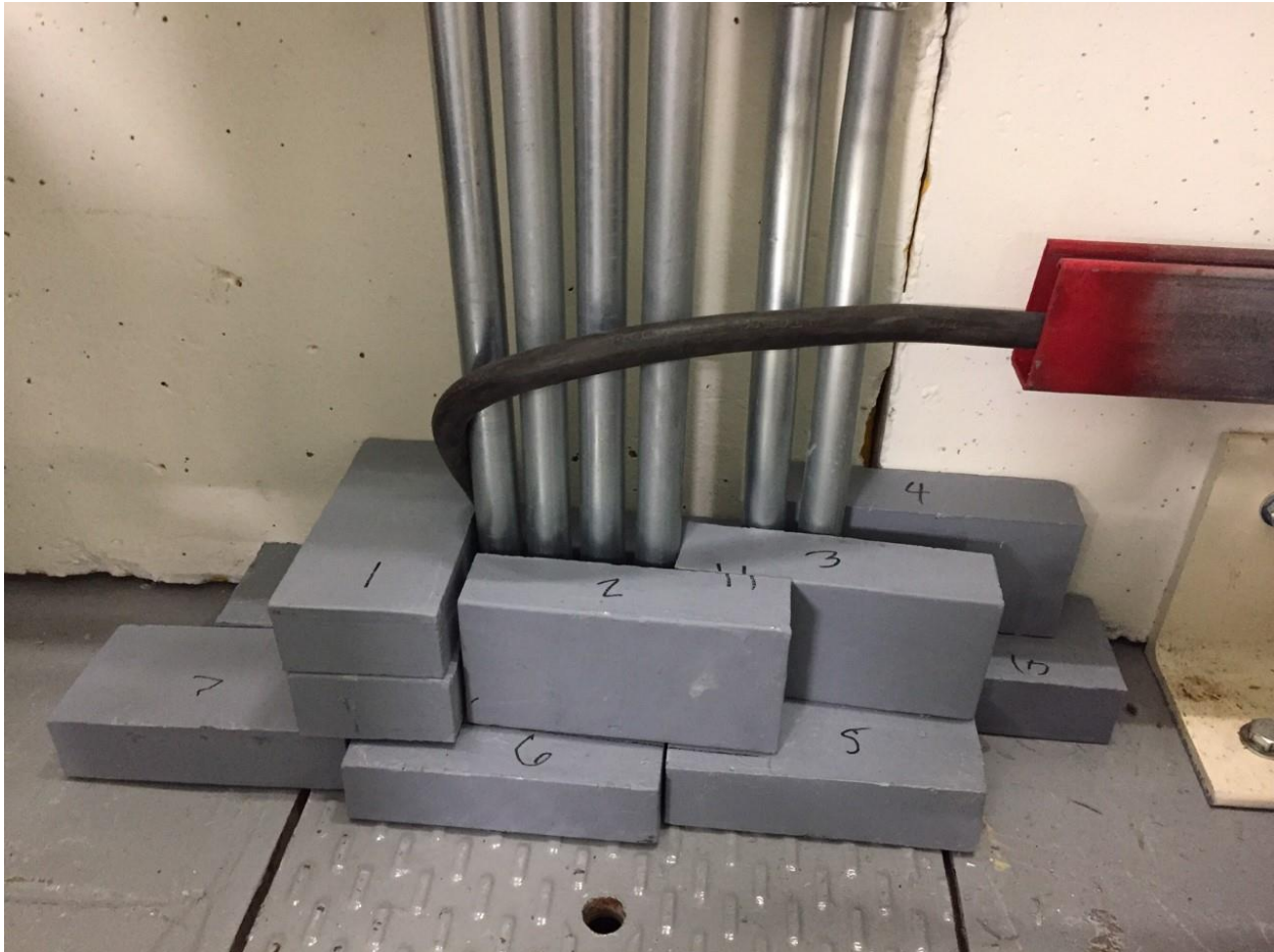
Figure 6 Trench 6 (middle of Cave2)