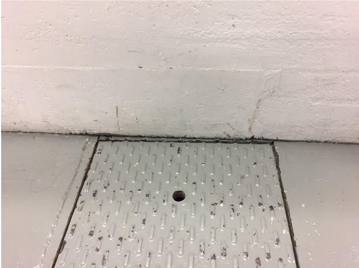
Figure 1 Trench 1 (nearest to the photogun, south side of UITF enclosure, Cave1)