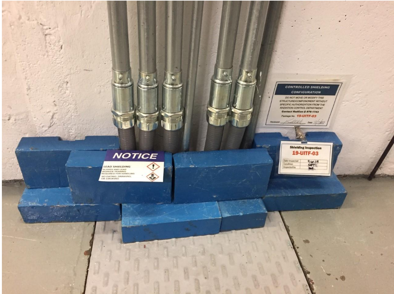
Figure 2 Trench 2 (near the keV spectrometer dump, Cave 1)