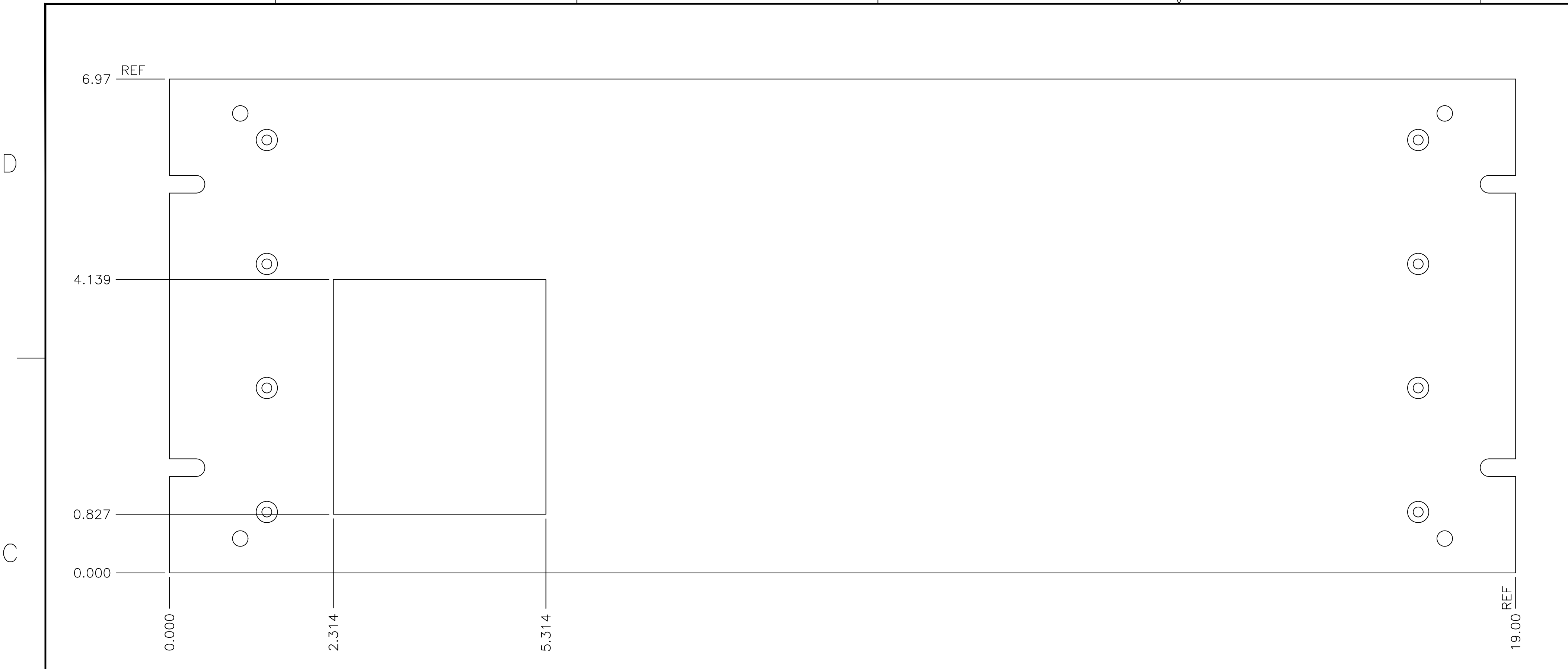
ITEM 1 MACHINING DETAIL