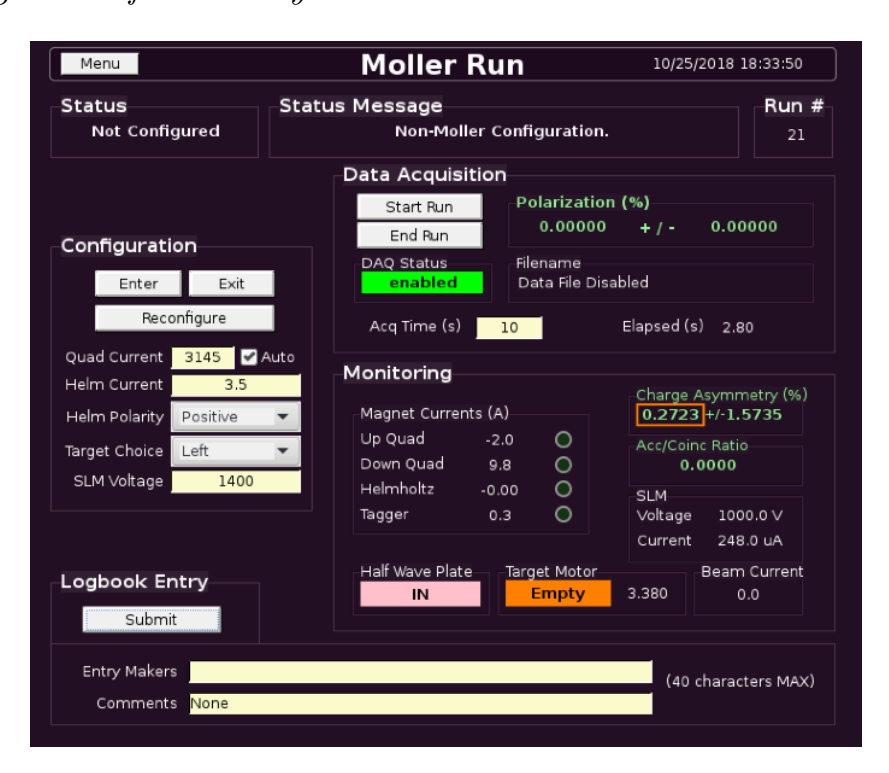
FIG. 1: The user interface for shift workers for operating a Møller run is divided into Status , Configuration , Data Acquisition , Monitoring , and Logbook sections. In this screenshot, the Møller system is not configured, according to the Status section, i.e. the setup is for non-Møller beam delivery.

Note, Møller runs must be performed with acceptable beam delivered to the tagger dump/yoke; consult the beamline manual for general procedures on establishing beam if necessary.