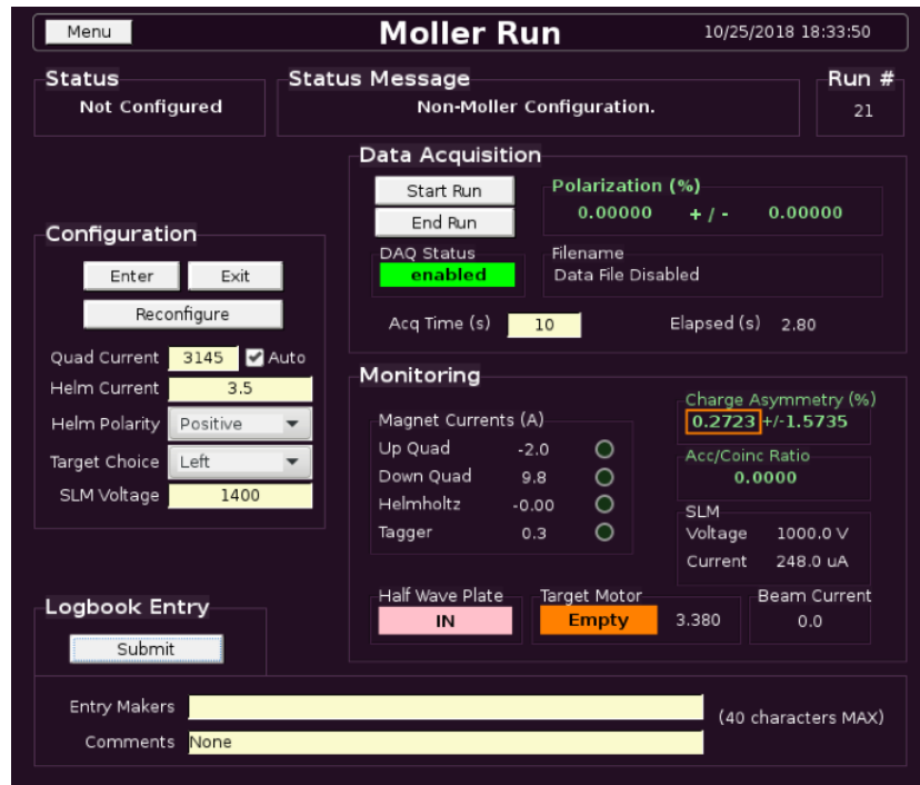
FIG. 1: The user interface for shift workers for operating a Møller run is divided into Status , Configuration , Data Acquisition , Monitoring , and Logbook sections. In this screenshot, the Møller system is not configured, according to the Status section, i.e. the setup is for non-Møller beam delivery.

Note, Møller runs must be performed with acceptable beam delivered to the tagger dump/yoke; consult the beamline manual for general procedures on establishing beam if necessary.