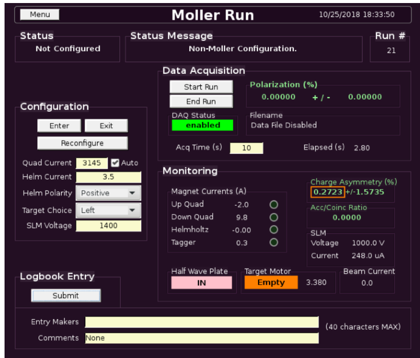
FIG. 1: The user interface for shift workers for operating a Møller run is divided into Status , Configuration , Data Acquisition , Monitoring , and Logbook Entry sections. In this screenshot, the Møller system is not configured, according to the Status section, i.e. the setup is for non-Møller beam delivery.

Note, Møller runs must be performed with acceptable beam delivered to the tagger dump/yoke; consult the beamline manual for general procedures on establishing beam if necessary.