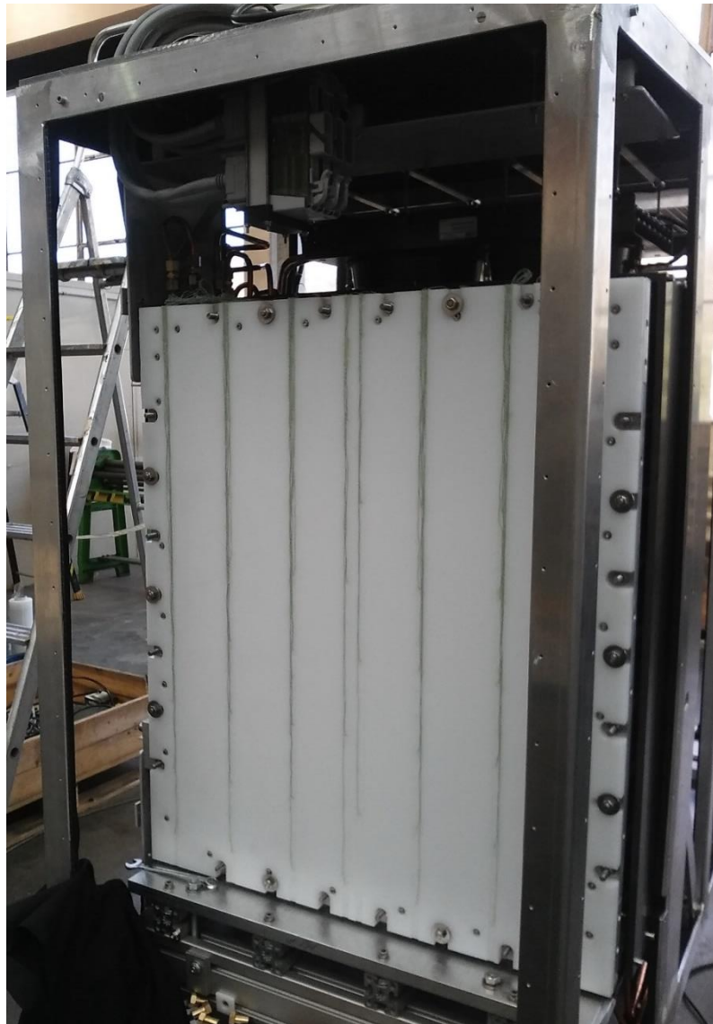
“Data taking” mode