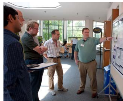
Judging during the 2012 Poster Competition.