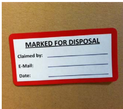
Label used to mark items.

As you are aware JLab has a very diverse collection of users who share office, storage and technical space at our facility. Over the past several years, as organizations have come and gone, we have accrued a significant amount of unclaimed property. This property (consisting of old computing equipment, file cabinets, books and documents, among other things) is distributed throughout the Lab and has grown in size to the point it is impacting the availability of user space.