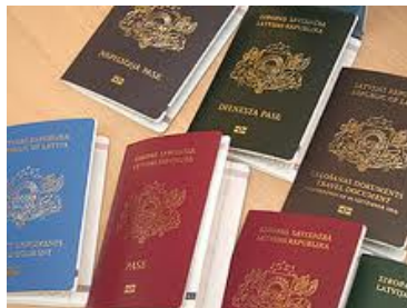
Examples of passports.

not always. Check the processing times posted on the web for the embassy/consulate of choice and allow additional time in case there is required "Additional Administrative Processing." This additional process can take 60-90 days to complete before the visa is issued.