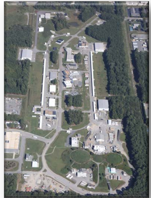
Aerial view of Accelerator Site

quarks are never found alone. With beam commissioning underway, the upgraded accelerator and the new experimental Hall D are complete and Halls B and C are 70 percent complete.