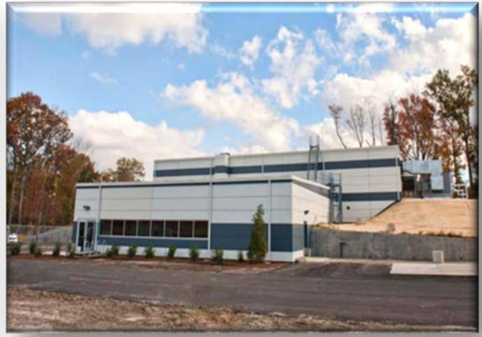
New Experimental Hall D is preparing for beam