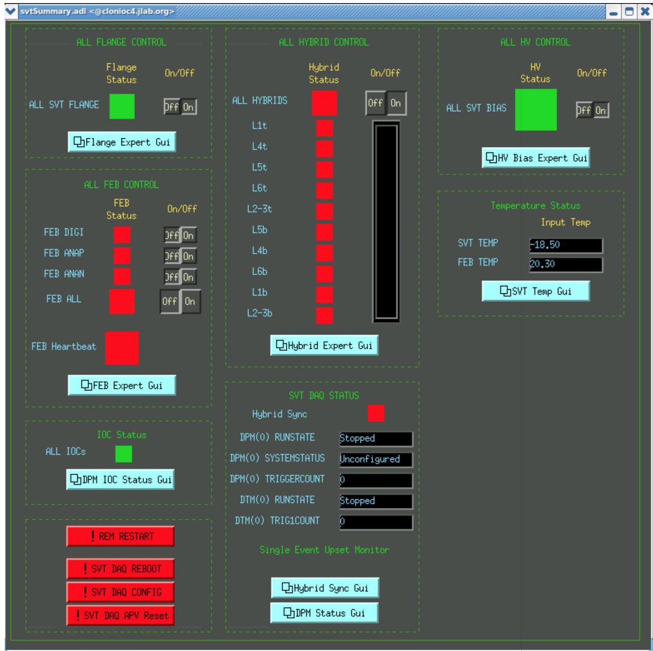
Figure 2: SVT summary GUI.